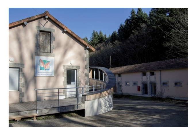
The Rural Digital Hub in Lormes, which houses the 'Mission Numérique' of the Nivernais Morvan, is a co-working community, a space for digital training and education, video-conference and meetings and a FabLlab. It offers individual offices with tailored ICT support.

The "Digital Mission" describes itself as an 'Accelerator of Digital Transformation' for the territory and has been the focus of digital innovation since 2003. The Hub opened in 2008 (in a former derelict slaughterhouse), offering training and educational facilities and eight small offices, and expanded in 2015 with a FabLab, improved office space for six more businesses and meeting-training facilities. It has a 300 Mbit/s connection.