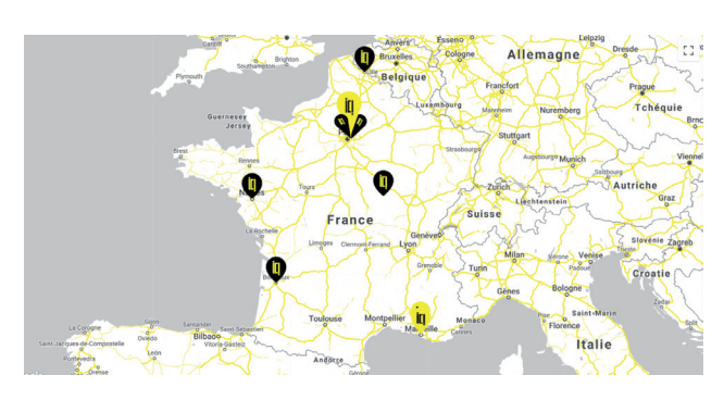
With the setting up of ICI Morvan Makerspace, Lormes and the Pays NM will be integrated into national & global Maker networks.

As with the first 'digital service' co-creation exercise, one of the priority projects is a local food hub with a single pick-up point, common ordering and coordinated logistics. More immediate actions, such as re-painting the shutters of public and private buildings, help galvanise the community and bring immediate, concrete results.